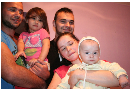
One family receiving support through RICF's abandonment prevention project